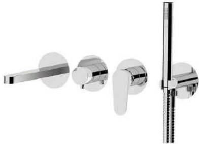
IMMAGINE - IMAGE